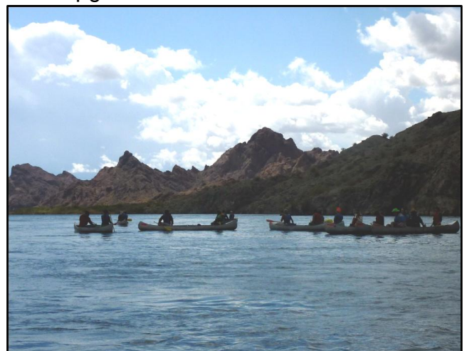
Course Area Training on the Colorado River

To unlock potential, Promote self discovery and Inspire growth.