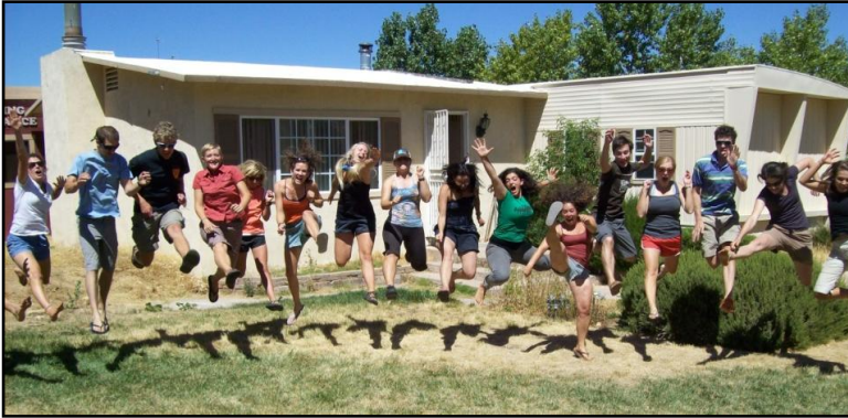
All Staff Training at the Boojum house

Staff housing is available for out-of-area staff between courses at our base in Anza. We have a furnished house with a full kitchen, bathroom, living room, laundry facilities, staff storage area, slackline, horseshoes, foosball table, hang board, tread wall, fruit trees and grapevines, and if all the beds are full or you just want to sleep outside, there are five acres to set up a tent. Boojum offers an