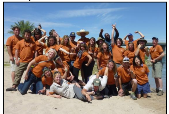
Before students arrive to the Colorado River

7. Logistician: (Limited Duration Field Staff). Responsible for assisting with any logistical program related tasks as assigned by Staffing and Training Manager, Program Manager, and or Course Director. Duties may include but are not limited to: purchasing, packing, preparing, inventorying or derigging food and or gear, caching water, and or driving transport vehicles.