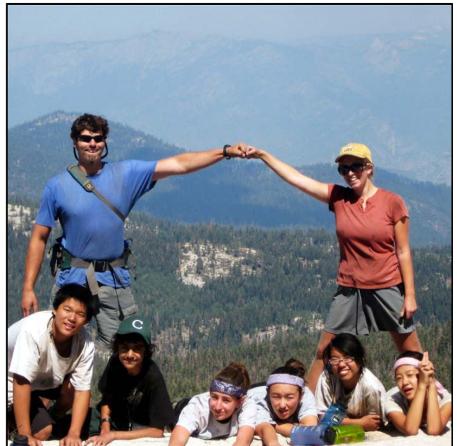
Taking a break from backpacking in the Sierras