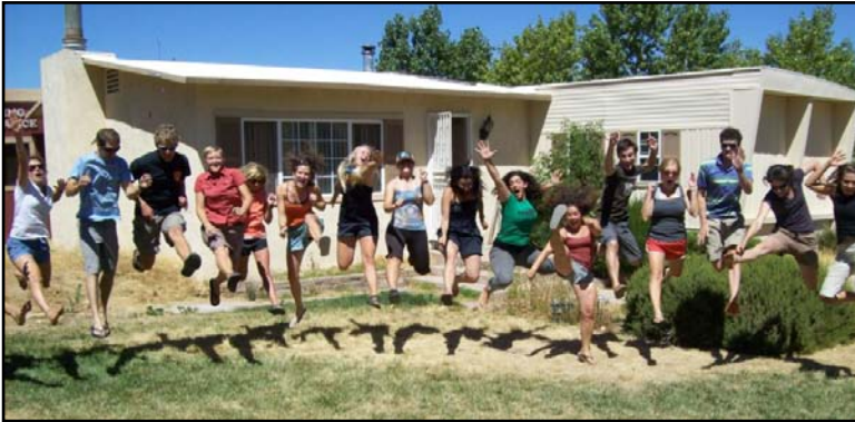
All Staff Training at the Boojum house

Staff housing is available for out-of-area staff between courses at our base in Anza. We have a furnished house with a full kitchen, bathroom, living room, laundry facilities, staff storage area, slackline, horseshoes, foosball table, hang board, tread wall, fruit trees and grapevines, and if all the beds are full or you just want to sleep outside, there are five acres to set up a tent. Boojum offers an