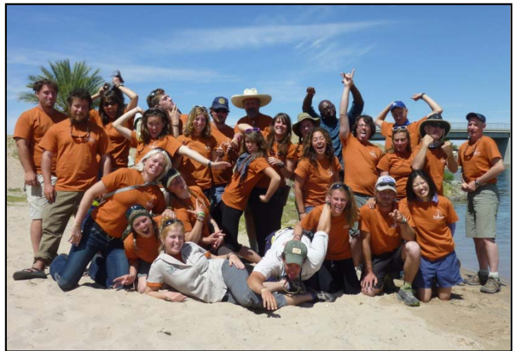
Before students arrive to the Colorado River

6. Instructor/Assistant Instructor: (Limited Duration Field Staff). Responsible for risk management, teaching, facilitation and leadership of small groups of students in the field. Responsible for course documentation and reporting.